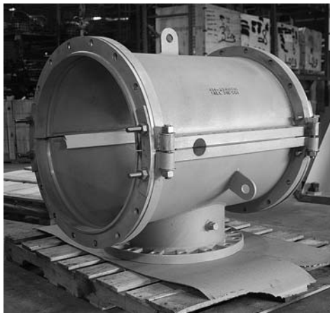
Above: 6414-24x16 All 316 Stainless Steel

The JCM 414 Fabricated Mechanical Joint Tapping Sleeve is recommended for taps on pipe that will not accommodate a direct top seal tapping sleeve. The 414 utilizes a true mechanical joint sleeve design that completely encompasses the tap area, eliminating any potential leaks due to pipe cracks or breaks. Side gaskets are internally and externally trapped in a recessed groove machined into the bolting lug bars that completely compress the gaskets creating the watertight seal on the sides of the sleeve. The end gaskets are compressed into the sleeve housing with mechanical joint end glands, providing the water tight seal on the ends of the sleeve and completing the full encapsulation of the tap area.