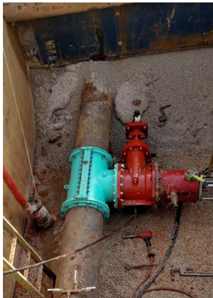
Above: 414-16x16 Epoxy Coated/Stainless Hardware