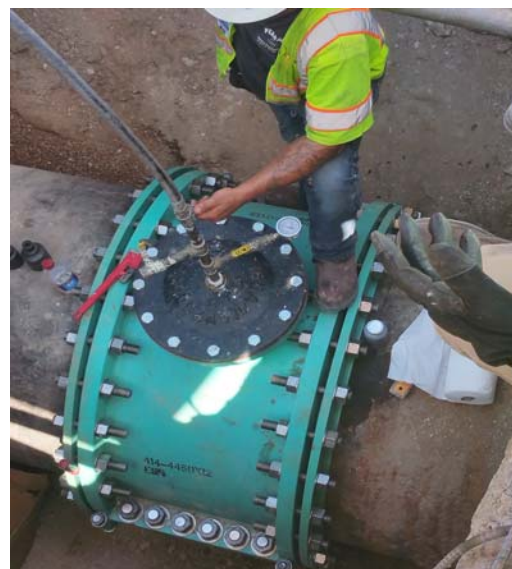
Above: 414-4450x12 Epoxy Coated/Stainless Hardware