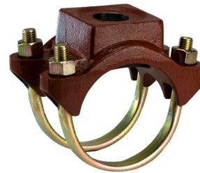
JCM 402 Service Saddle Outlet Sizes 1-1/4" – 2-1/2"

This typical specification, provided by JCM Industries, is a proposed guideline for use by specifying agencies to ensure significant design and material features of this product are included within the agencies' individual specifications.