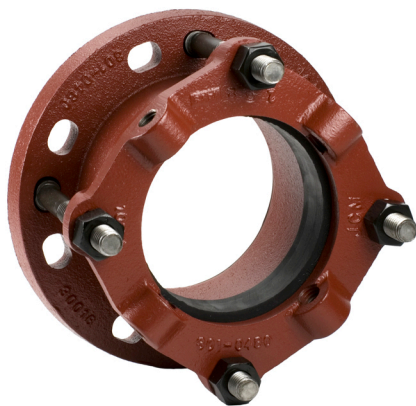
JCM 301 Flanged Coupling Adapter

Note: For applications with High Density Polyethylene Pipe, refer to the JCM HDPE Fittings Manual or contact JCM Industries.