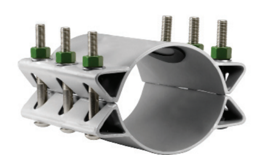
Available Options: Carbon Steel Construction Stainless Steel Construction With/without Threaded Outlet Epoxy Coated Alloy Hardware Stainless Steel Hardware Custom Repair Sizes