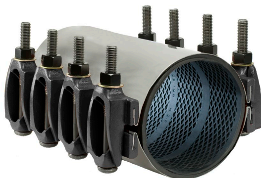
JCM 102 Multi Band Universal Clamp Coupling Image reflects 12" width

JCM 100 Series Universal Clamp Couplings meet or exceed ANSI/AWWA C230 Standard for Stainless – Steel Full-Encirclement Repair and Service Connection Clamps as applicable.