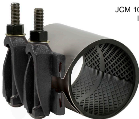
JCM 101 Universal Clamp Coupling Image reflects 6" width

JCM 100 Series Universal Clamp Couplings meet or exceed ANSI/AWWA C230 Standard for Stainless – Steel Full-Encirclement Repair and Service Connection Clamps as applicable.