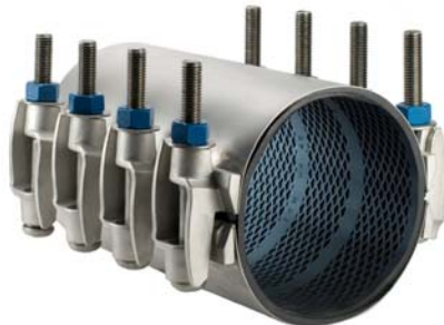
JCM 132 All Stainless Steel Universal Clamp Coupling Image reflects 12" width

JCM 100 Series Universal Clamp Couplings meet or exceed ANSI/AWWA C230 Standard for Stainless –Steel Full-Encirclement Repair and Service Connection Clamps as applicable.