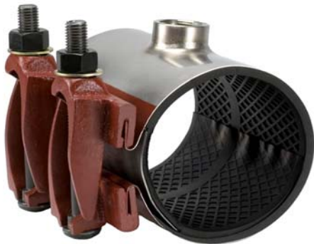
JCM 173 Universal Clamp Coupling Image reflects 6" width

This typical specification, provided by JCM Industries, is a proposed guideline for use by specifying agencies to ensure significant design and material features of this product are included within the agencies' individual specifications.