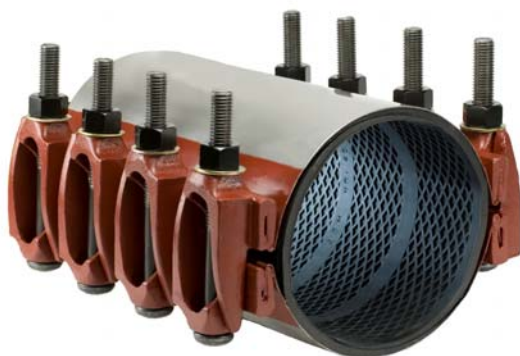
JCM 172 Multi Band Universal Clamp Coupling Image reflects 12" width

JCM 100 Series Universal Clamp Couplings meet or exceed ANSI/AWWA C230 Standard for Stainless –Steel Full-Encirclement Repair and Service Connection Clamps as applicable.