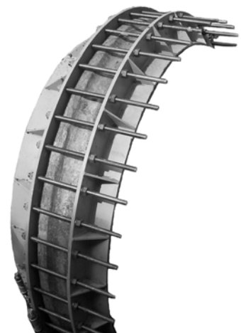
JCM 143 - 14" - 36"