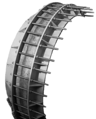
JCM 143 - 14" - 36"