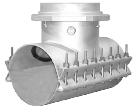
JCM 459 - 465 Stainless Tapping Sleeve Mechanical Joint Outlet*